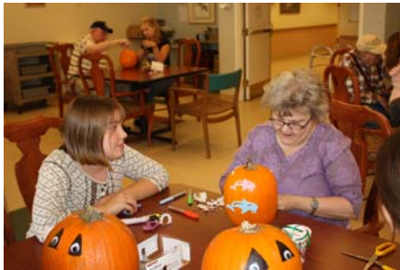
Pictured above and below are students in the F.O.R. club decorating pumpkins at the nursing home.