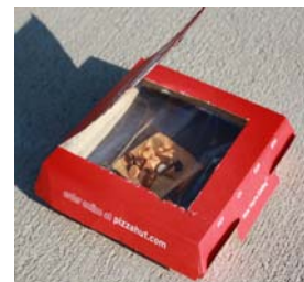
Above: A solar oven in action!