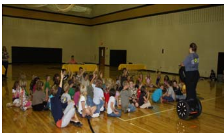
Above: Students getting instructions before Cosi-On-Wheels begins