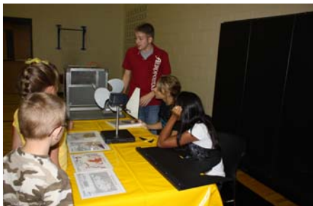
Above: Students viewing a Cosi-On-Wheels experiment