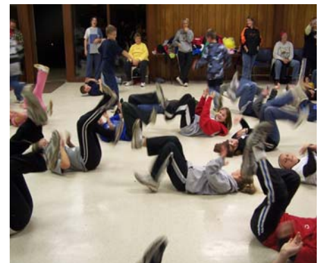
Above: The "Cockroach" dance