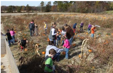
Above: Students searching for pumpkins in the pumpkin patch. Below: Students learning about the sheep the Menchhofer's house on the farm.

The kindergartners took a field trip to Menchhofer Farms on Wednesday, October 20. The kids took a wagon ride to the pumpkin patch to pick one pumpkin, two gourds, and one Fuji apple. Then the students rode the wagon back to the farm, where they got a tour of the barn while looking at farm animals in the process. They learned about the different kinds of animals the Menchhofer's raised which included cows, pigs, sheep, goats, and donkeys. The kids were then rewarded with a campfire and enjoyed s'mores as a special treat. The field trip ended with the students learning how pumpkins grow and the different kinds of seeds that exist in different kinds of plants and fruits.