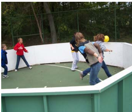
Above: Students playing in the "Ga Ga Pit"