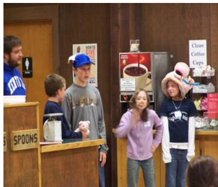
Above: Students posing as pigs as punishment for having piggy waste