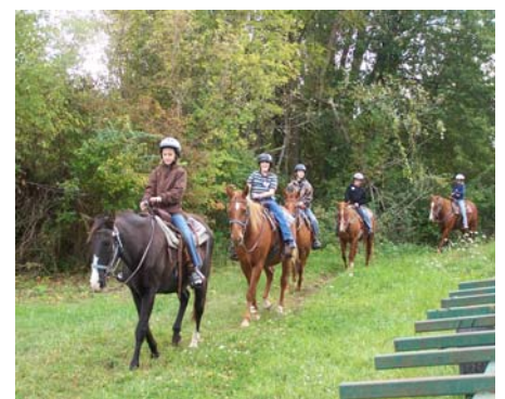
Above: Students enjoying the horseback riding portion of the trip