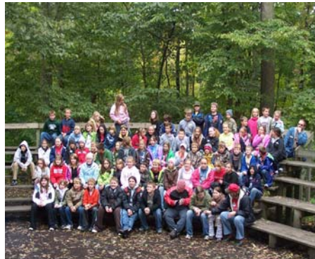
Above: All of the students at Camp Willson