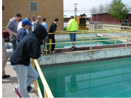
Middle School students learn about a water treatment plant as part of Get R.E.A.L. Week

bly with a discussion. On Friday, May 8 the students participated in many things. Breakout sessions