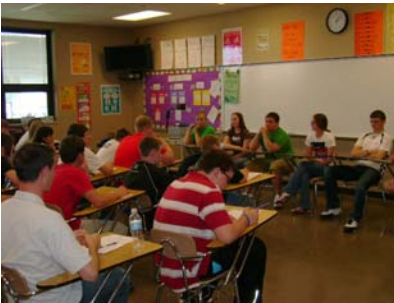
A panel of high school students lead a discussion with middle school students during Get R.E.A.L. Week

Get R.E.A.L. is a program that is a week long event in the middle school. Get Responsible Enough About Life is focused on teaching kids about character, responsibility, and typical everyday things. This year the middle school staff worked together to create the activities for the week. On Tuesday, May 5 the students watched a movie about eating habits. They then discussed the movie and created KWL charts. KWL charts help students identify what they already know, what they want to learn and finally what they have learned. Students created these with the help of teachers. There was also a Health Fair on Tuesday, where students learned